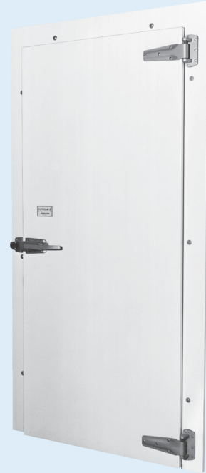
Cooler Door Shown Right Hand Swing