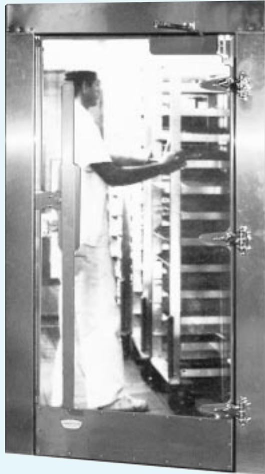
Right Hand Swing Door Shown